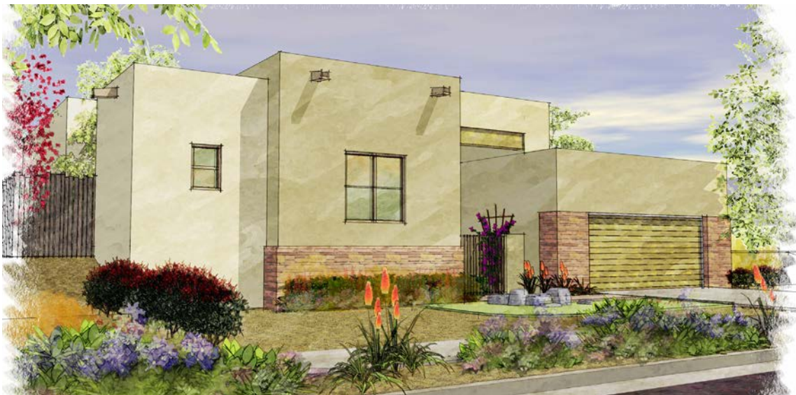
SUNROSE MODEL HOME

There are several floor plans to choose from, with two, three and four bedrooms.